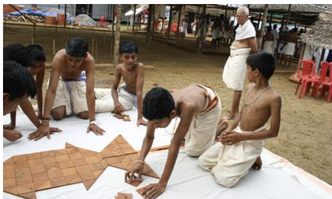
Children arranging a miniature eagle altar used in India's ancient rituals (Kerala, April 2011).